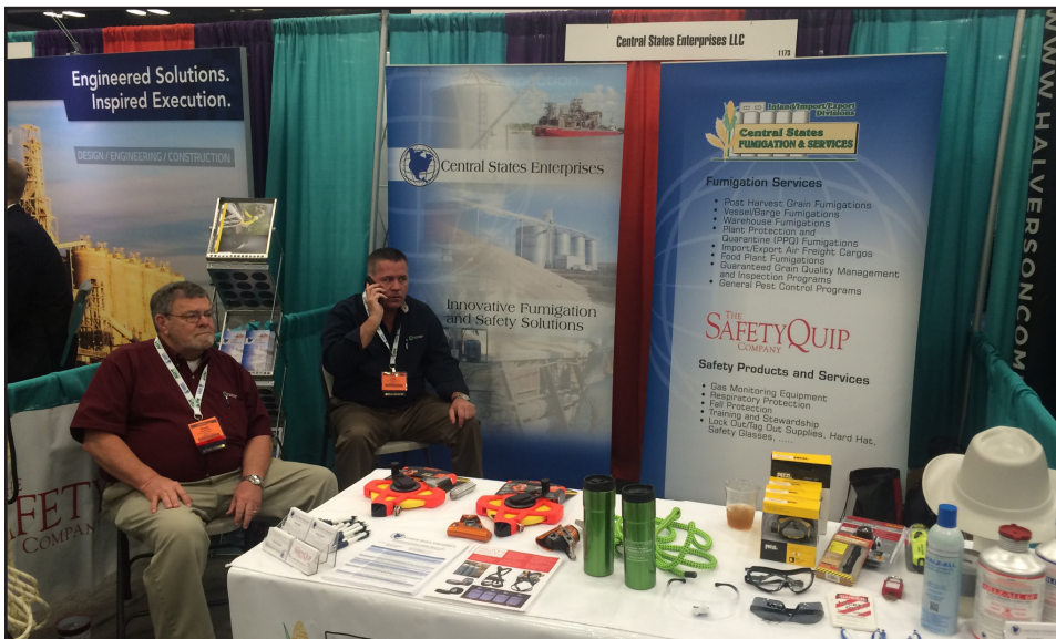
Central States Enterprises at the 2016 GEAPS EXCHANGE in Austin, TX. CSE was part of the record breaking number of exhibitors that boasted nearly 2,900 visitors representing 28 different countries. Central States is looking forward to next year’s event in Kansas City.